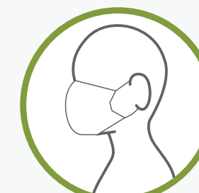
NO-SEW MASK USING A FOLDED SCARF/BANDANA AND RUBBER BANDS/HAIR TIES

For more information on non-medical masks or face coverings consult: https://www.canada.ca/en/public-health/services/diseases/2019-novel-coronavirus-infection/prevention-risks/about-non-medical-masks-face-coverings.html